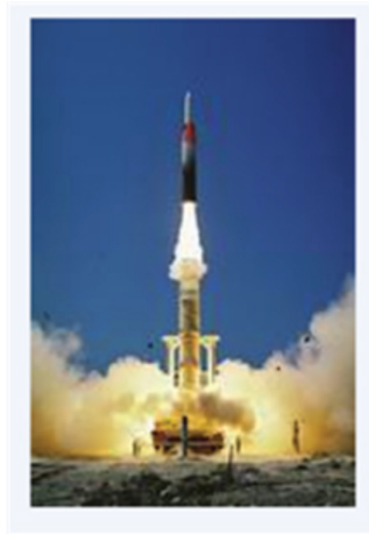
Launch of Tactical Missile Interceptors