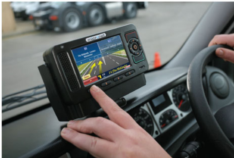
Cabin-mounted Micronet rugged mobile tablet computer