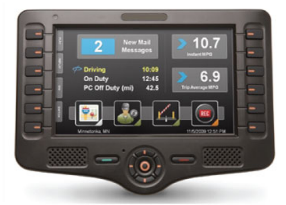
Micronet Series CE500 rugged mobile tablet computer